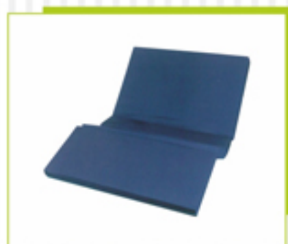
Fireproof & waterproof mattress