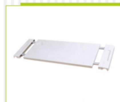
M01a Dining table