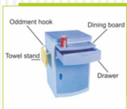
Z01 ABS Bedside cabinet