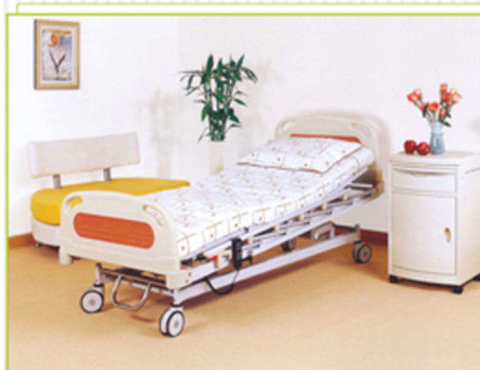
B868Y-S Electric bed

Size: 2180 x 1000 x 480/720 mm Standard device: 4pce actuators, 1pc control box, 1pc handset 1pair aluminium alloy bedside rails 4pcs luxurious central locking castors 2pcs urine hooks, 6pcs IV drip holes