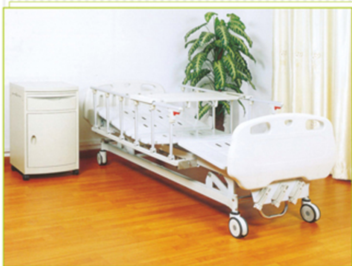
868C3 Three crank manual bed

Size: 2210 x 950 x 480/720 mm Standard device: 3sets manual crank system 1pair aluminum alloy bedside rails 4pcs luxurious central locking castors 2pcs urine hooks, 4pcs IV drip holes