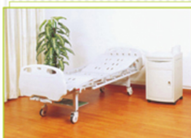
868C2 Two crank manual bed