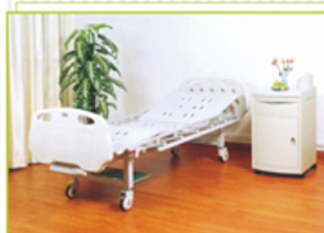
868C1 Single crank manual bed