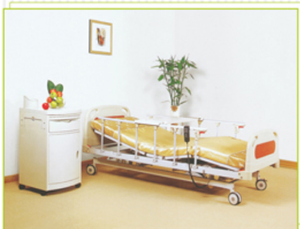
868C3 Electric bed

Size: 2180 x 1000 x 480/720 mm Standard device: 3pce actuators, 1pc control box, 1pc handset 1pair aluminium alloy bedside rails Luxurious double-face castors (2pcs with brake, 2pcs without brake) 2pcs urine hooks, 6pcs IV drip holes Optional choose